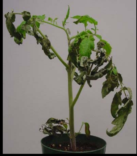
Plants dipped into Pst2 solution