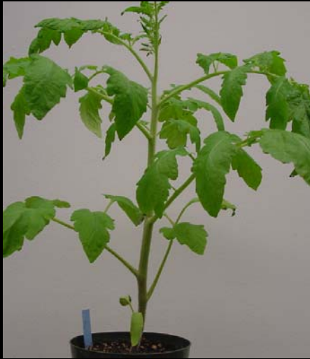
Plants dipped into Pst1 solution